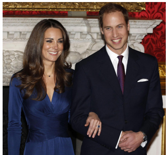
Prince William and Miss Kate Middleton pictured for their engagement announcement in November 2010.

wedding relationships Prince William Kate Middleton rings unending love